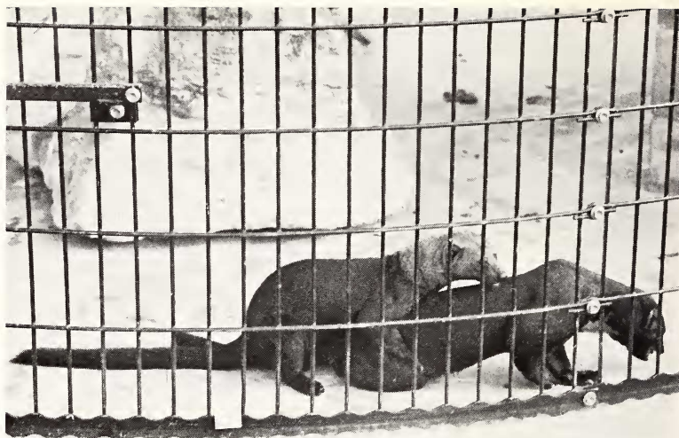
Fig. 3. Mounting of ♂ by ♀; note absence of nape bite

(16 minutes) was observed with stimulation movements and series of thrusts. Intromission was doubtful. January 20: a long lasting copulation (86 minutes) was seen during which the ♂ lost intravaginal contact once. The vulva of the ♀ was conspicuously swollen. On January 21 the ♀ struggled and thwarted the ♂, which broke off his attempts of mounting after 10 minutes.